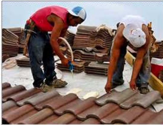
A tile roof being installed

Tile roofs are more common in warmer climates and are typically made of clay, concrete or rubber. They are very heavy and usually require a substantial support system. They have a useful lifespan of up to 50 years.