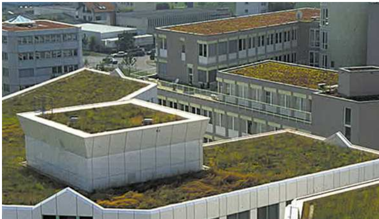
A “green” roofing system in an urban setting

There is a unique concept in roofing that has come to be known as the “green” roof and has gained popularity, particularly in urban settings, because it reduces heat and air conditioning costs and reduces carbon dioxide in the atmosphere. The typical application calls for zone appropriate plants in soil over layers of protective membrane. It appears to have the same useful life span as the synthetic membrane roof system.