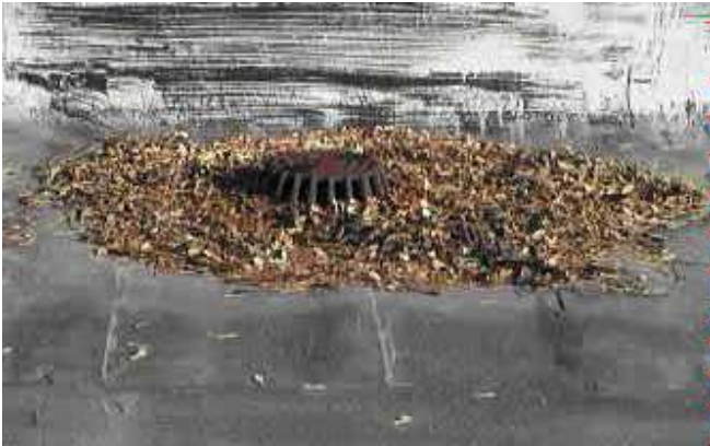
Debris blocking a roof drain

Debris should not be allowed to build up as it traps water, causes deterioration of roofing materials and blocks proper drainage. Debris removal is particularly critical on flat roofs to prevent the ponding of water. Care should be taken to look for debris build up around and under air conditioning units and other roof mechanical systems.