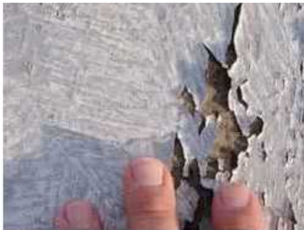
A badly cracked and blistered roof membrane

Blistered, cracked or separated roof surfaces allow water to enter and make its way into the insulation layer and eventually to interior spaces.