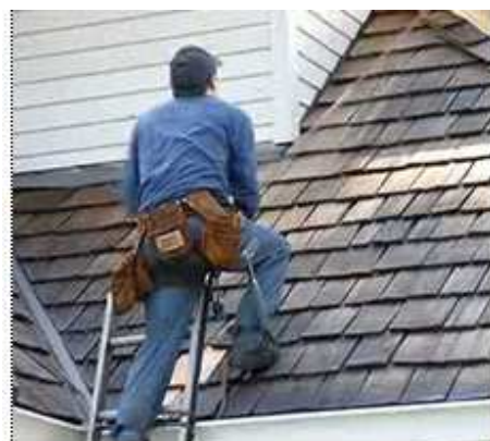
A cedar shake roof