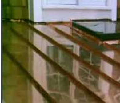
A raised seam copper roof