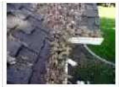
Debris blocking a gutter system

A very large percentage of roof failure is attributed to damaged or deteriorated flashing. Flashing is usually made of aluminum or membrane strips that are adhered to building structures and designed to direct water on to the roofing system