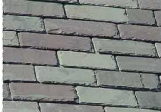
A slate roof