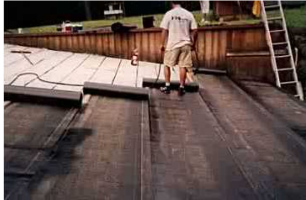
A synthetic membrane roof being applied

There is a unique concept in roofing that has come to be known as the “green” roof and has gained popularity, particularly in urban settings, because it reduces heat and air conditioning costs and reduces carbon dioxide in the atmosphere. The typical application calls for zone appropriate plants in soil over layers of protective membrane. It appears to have the same useful life span as the synthetic membrane roof system.