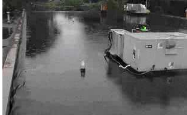
Pooled water on a flat roofing system

Blistered, cracked or separated roof surfaces allow water to enter and make its way into the insulation layer and eventually to interior spaces.