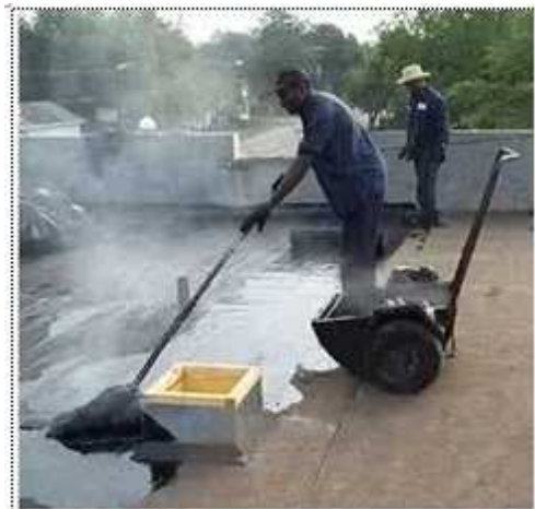
A hot asphalt built-up roof

Flat roofs are a common roof style for commercial applications and are typically one of three types, tar and gravel, asphalt built-up and synthetic membrane. The tar and gravel roof is probably the oldest method of covering a flat roof and one of the most troublesome due to its vulnerability to pooled water and cold temperatures. The application of a tar and gravel roof traditionally utilized heated coal tar, which is a byproduct of the coking process in the coal industry. Gravel is applied on top. An asphalt built up roof utilizes heated asphalt, which is a byproduct of the oil industry. This is applied to successive layers of roofing felt with a gravel top layer. The asphalt built up roof is considered superior to a tar and gravel roof but is vulnerable to oxidation and cracking. Both of these roof systems have a useful life span of about 10 years.