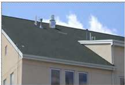
Typical asphalt shingle roof

Shingles are used on pitched roofs with the most common being asphalt shingles. Asphalt shingles can have a useful lifespan between 20 to 50 years. Another common roof shingle is referred to as wooden shakes, which are made from cedar, spruce or treated pine that has been split to shingle length. These generally have a 30 year life span. Slate shingles are not often used in commercial applications due to their high cost, but they can have a life span up to as high as 75 years.